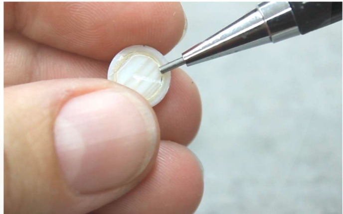
Inside a pearl the nucleus & nacre layers are visible

All other things being equal, the thicker the nacre the higher the value will be.