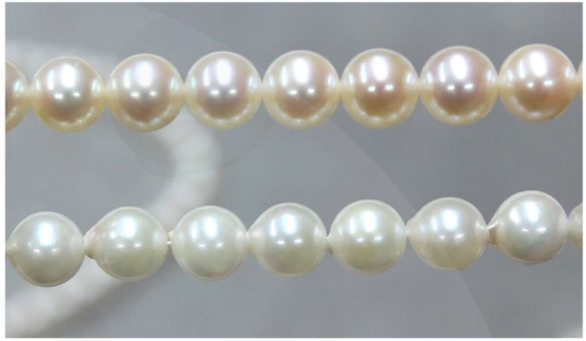
Higher lustre (top) vs lower lustre (bottom)

All other things being equal, the higher the lustre the higher the value will be.